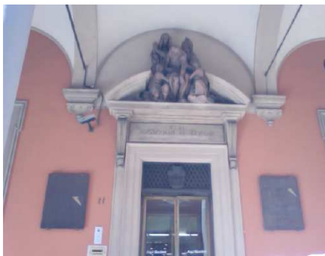
Figure 4: Monte di Pietà di Bologna