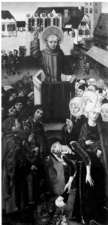
Figure 3: The sermon of Saint Giovanni da Capestrano, Historisches Museum.