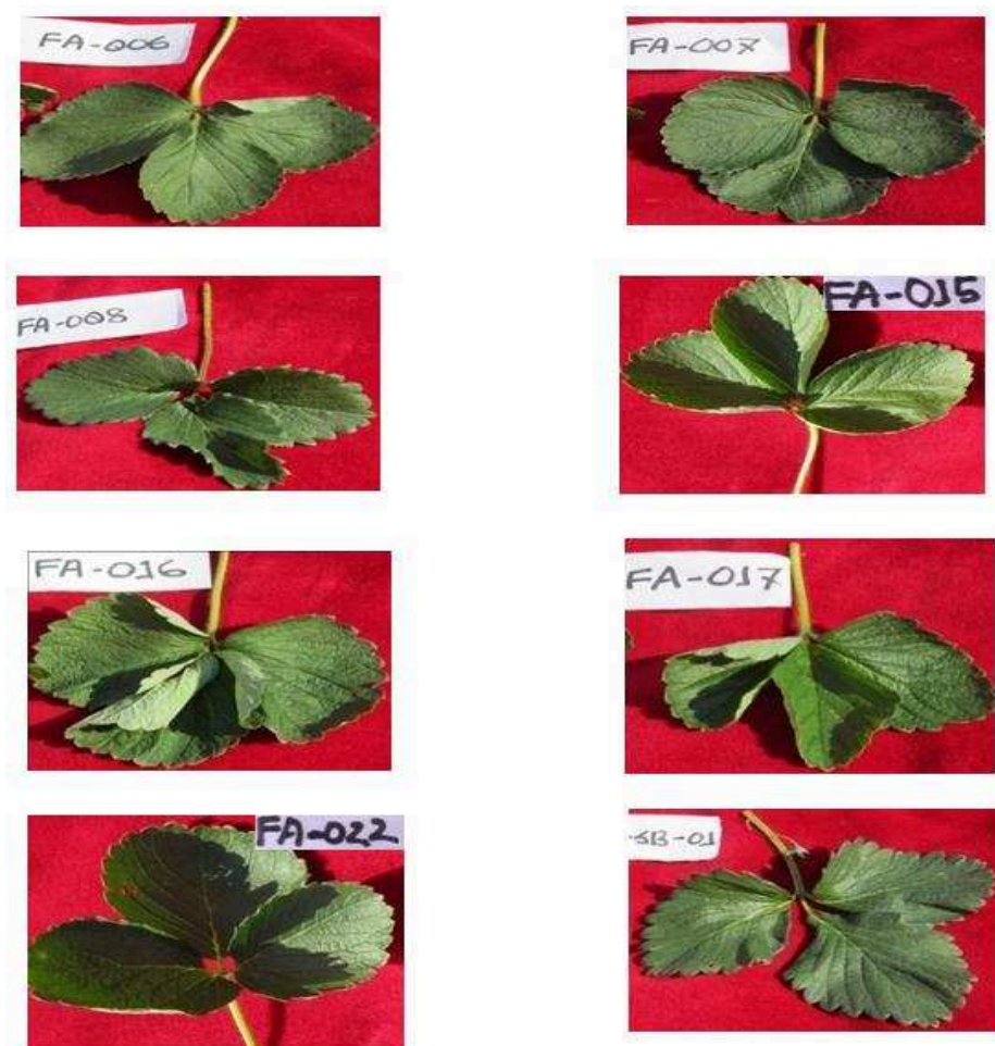
Fig-1. Leaf characteristics of eight strawberry genotypes