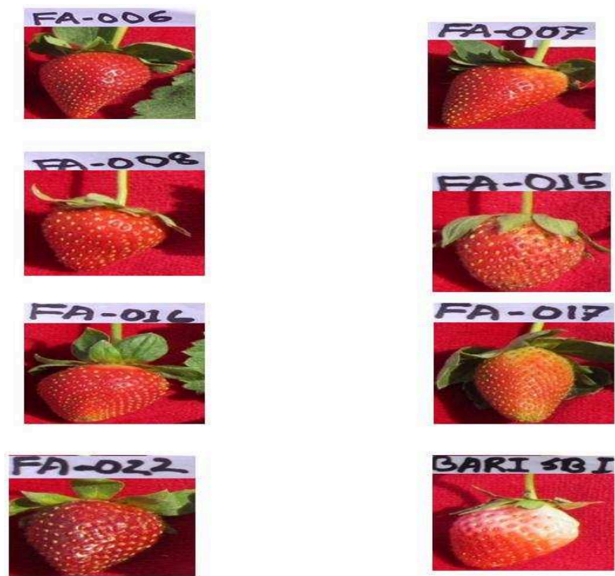
Fig-2. Fruit characteristics of eight strawberry genotypes