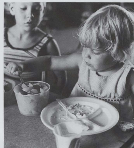
Children participating in WIC showed significant increases in intake of key nutrients, including iron, vitamin B 6 , and folate.

To control for observable differences between participants and nonparticipants, we used a statistical model employing multiple regression techniques. The model included a number of socioeconomic characteristics thought to influence nutrient intake as independent variables, including the main variable of interest—whether or not the child participated in the WIC program. Other independent variables included the age, sex, and race/ethnicity of the child, and household characteristics, such as annual income, homeownership,