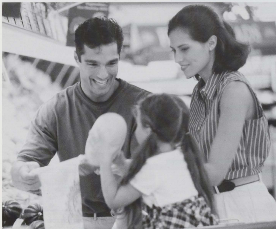
Two-parent families with children were among household types whose use of food stamps dropped sharply between 1995 and 1999.

These findings do not negate the important role of the strong economy in the food stamp caseload decline. Rather, they demonstrate that other factors were also at work—factors that reduced use of food stamps by some households that still felt in need of more food than they were getting. The sharp drop in use of food stamps by low-income households accounted for more than half of the overall decline in the food stamp caseload. The substantial increase in food insecurity among low-income households that did not receive food stamps indicates that low-income households were generally less aware of their eligibility for food stamps or found it more difficult or less socially acceptable to get food stamps in