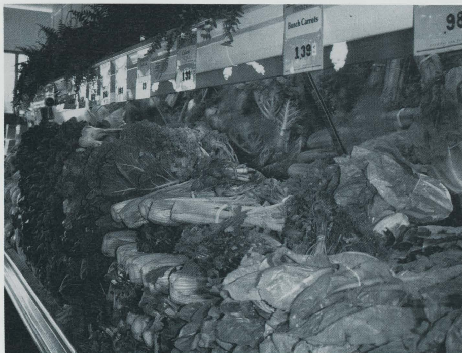
The cold, wet weather throughout the first half of 1993 pushed up prices for meat and fresh vegetables—particularly lettuce and tomatoes. Combined, these foods carry a 16-percent weight in the food CPI and are responsible for about a third of its 2.2-percent rise in 1993.

demand for food, will also be sluggish. This is not to say that consumers eat less—rather, they buy different kinds of foods. For example, consumers cut back on foods with convenience or services added, such as heat-and-serve and other ready-to-eat foods. People