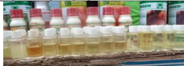
Figure 4. Repackaged pesticides sold in Gambia

in the advanced stages of ISO accreditation, and they hope to receive final certification by the end of 2017.