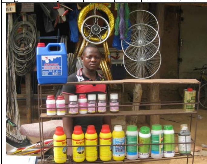
Figure 2. Bicycle repair shop sells pesticides, Mali

The number of registered pesticide products has likewise increased rapidly. Time-series data available from Ghana, Guinea and the Sahelian