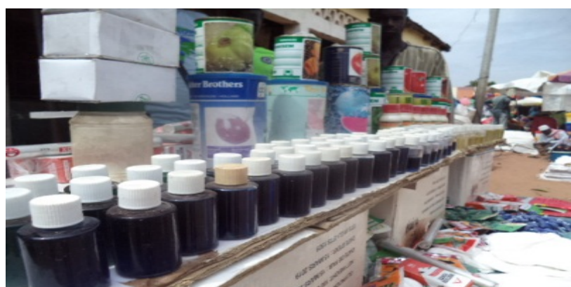
Figure 3. Some labeled and unlabeled inputs sold on the Farafenni Lumo

These products include mainly insecticides and a few fungicides: