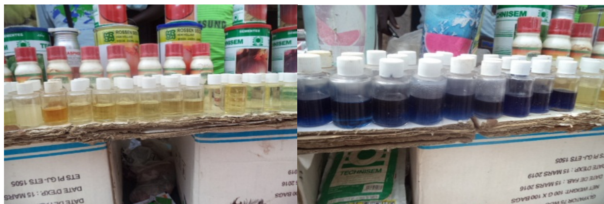
Figure 1. Insecticides and other inputs sold at the weekly markets (Lumos)

The major pesticide importers (GHE, Haja and Sangol) reported that there exists a very few of counterfeit and unregistered imitation products available on the Gambian market, although as reported by Murphy 8 (2005) a significant percentage of the pesticide products sold at local markets in the Gambia in 2005 are considered extremely hazardous. Given highly porous border crossings into the Gambia from Senegal, smuggled pesticides may arrive in the Gambia. The traders we interviewed estimate that unregistered or counterfeit herbicides account for less than 5% of volumes of pesticides sold domestically. However, regulators believe the share may be much higher given that many products are repackaged in unmarked containers (Figure 1) and some imported pesticides are labeled with trade names registered by other firms.