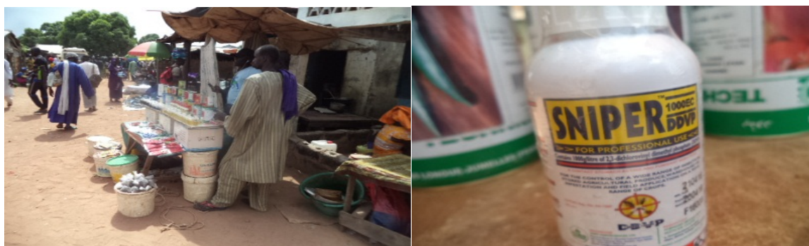
Figure 5. Insecticides and other inputs on the Wassu Lumo

Among these seasonal sellers interviewed 12 , some are registered. The market survey indicate that although they do not have proper shops they are licensed by the Pesticide Management Board and the sales monitored and controlled by inspectors under the national environment agency. The manner of selling was done in the open space with pesticides displayed on the table with other agricultural inputs (fertilizer, seeds, etc.). Most pesticides sold have labels so the vendors know what crops they are being used for. Some pesticides sold are unlabeled plastic bags or containers. Vendors likely mixed multiple pesticides together for resale. As for