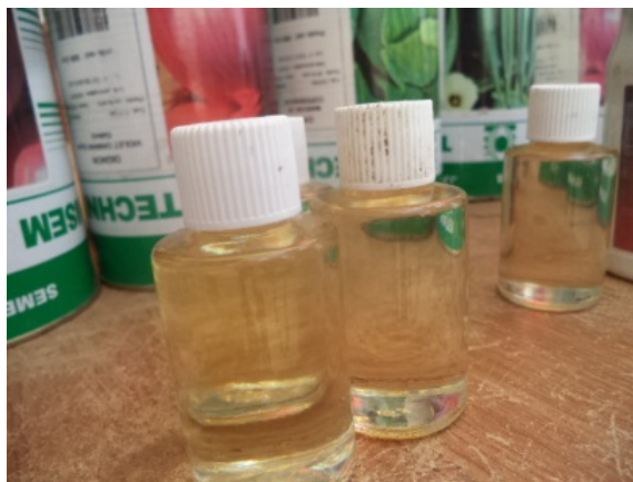
Figure 6. Insecticides sold in unlabeled containers on the Wassu Lumo

knowledge on safety precautions, the survey indicates that vendors are aware of the harmful effects of pesticides and they know the safety precautions associated to dealing with pesticides. Though, through observation they don't have any personal protective gears. Questionable, how the vendors properly mix the pesticides, how farmers apply them and protect themselves and their families during use.