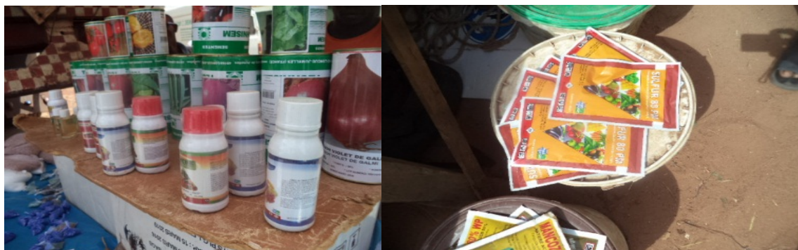
Figure 4. Insecticides and other inputs on the Farafenni Lumo

sold at D100/bottle of 125ml; Endosulfan 25% Thirame sold at D50/Sachet of 25g; Granox millennium-Imidacloprid 17%; Thiram 10% Carboxin 10% sold at D100/sachet; Mancozeb 80% WP; Sultus 80% WDG; phostoxin; Fungicides: Caiman Rouge 25%; Raticides: Ratox-Raticide Cebo-pellet sold at D5/sachet of 20gr;