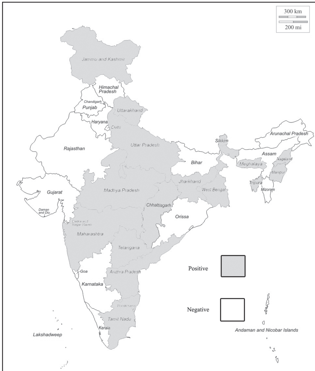
Figure 3. Map depicting compound annual growth rate of pesticide consumption in different states of India: 2012-13

It can be seen that Union territories like Daman & Diu (-14.65%), Chandigarh (-12.58%) and Lakshadweep (-9.43%) had highest negative growth rate of pesticide consumption in the country while it was Mizoram, Gujarat and Assam in the case of states. The general policy towards organic production can be facilitated only if the pesticide sales are regulated and organic alternatives are popularized. However, these trends do not reflect the type of pesticide material that is consumed and hence, we cannot conclude that these