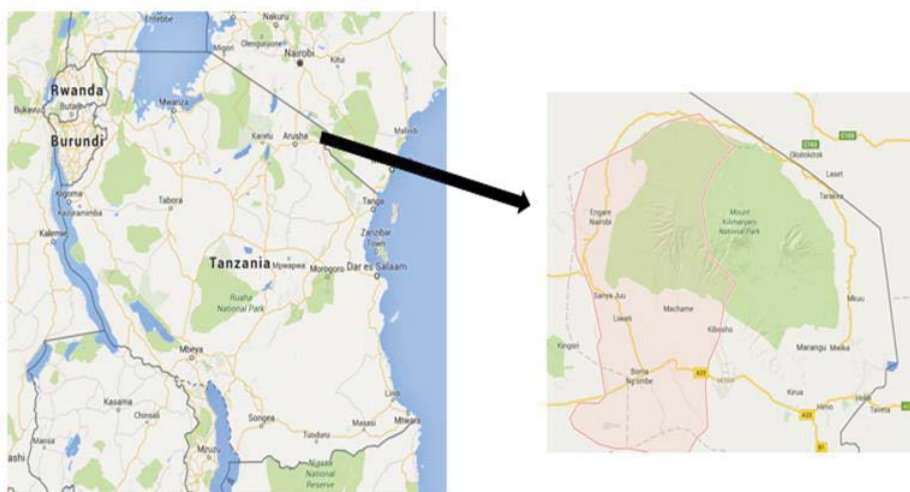
Figure 1 Map of Tanzania showing the location of Hai district

The major agricultural activity is mixed farming. Farmers keep livestock as well as cultivate food and cash crops. Apart from dairy, farmers keep local chickens, sheep and goat. The main crops grown include maize, beans, bananas and coffee. Coffee is a cash crop while banana is both food and cash crop.