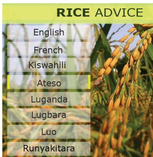
Figure 3. Generic languages of a translated video version

multiple responses indicated that all the farmers (100%) started planting rice in lines using the forked rake or making imaginary lines using a hand hoe. They found use of a fork method as an effective method because it allowed use of lower seed rates (25 kg were planted in an acre using a forked rake compared to broadcasting where 40 kg were being planted). Planting in lines using forked rakes was thus accredited for controlling the plant population in the field as compared to broadcasting. In addition, farmers found it easy to weed, spray chemicals and move through the field when rice was planted in lines.