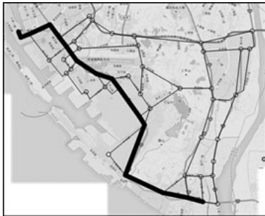
Figure 4(a): Min Travel Cost