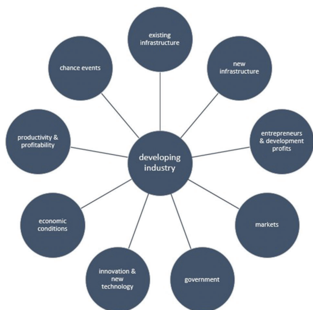
Figure 1: Proposed factors in the development of the Canterbury dairy industry

Informants did not consider that there was a large involvement of government in the development of the Canterbury industry. However, there was recognition that the major growth occurred after the removal of most government support for agriculture in the 1980s. The removal of price supports, particularly to the sheep and cropping industries in 1984 (Rayner, 1990), meant that these farming systems became less economic and, so were more likely to be sold or converted to other farming systems such as dairying. The loss in profitability of the historic sheep and cropping systems was a major driver of development. In general, farmer informants focused on ‘close to farm’ factors and did not identify, without prompting, the efforts of government in international trade negotiations or changes in international markets.