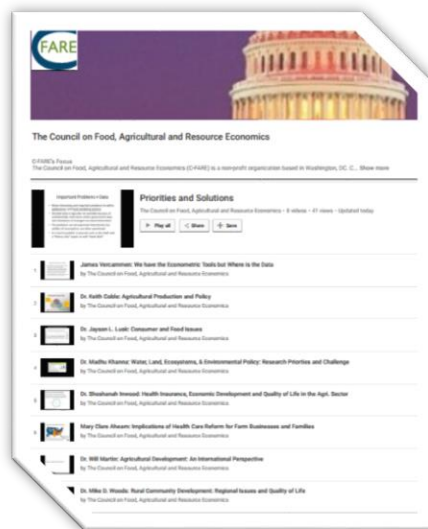
C-FARE's YouTube Channel