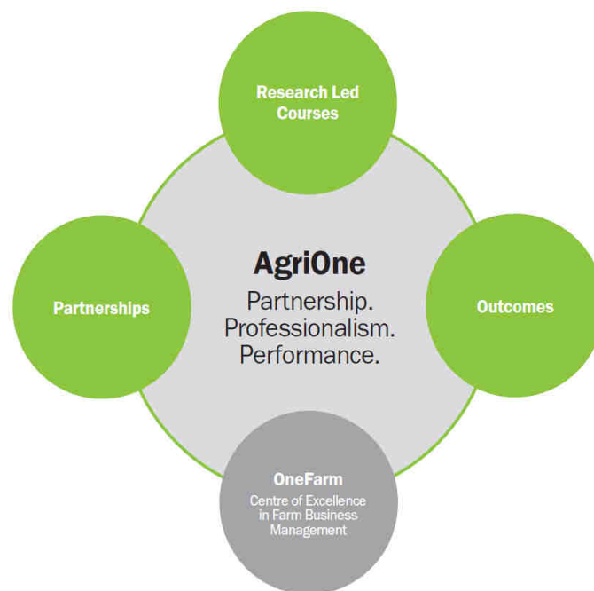
Figure 1: Overview on AgriOne

Within Agri One, a key project of work is the Centre of Excellence in Farm Business Management (OneFarm) (Fig. 1).