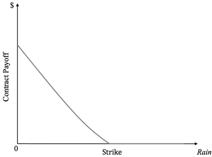
Figure 1. Payoff Structure of the Weather Derivatives Contract

For the purposes of this paper, we use a contract structure based on Vedenov and Barnett (2004). Namely, we define the contract as a put option without imposing any limits on contract payoff (the “fully proportional” contract described by Vedenov and Barnett, 2004). Such a contract pays nothing as long as the index is within the acceptable range and pays a proportionally higher indemnity whenever the index falls below a specified strike.