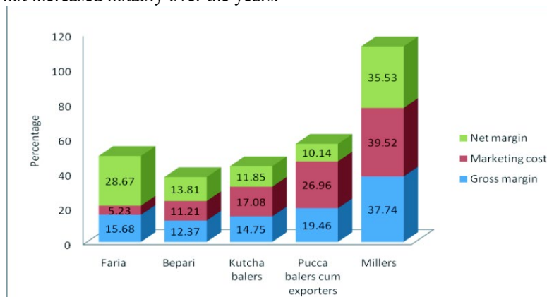
Figure 2. Share of different intermediaries in cost and margins for jute

It is seen from the Table 3 that marketing margin varied mainly due to variation in prices and marketing costs of raw jute for the intermediaries. It can be inferred from the above findings that except millers, faria received higher profit in raw jute marketing system though it could not be considered as an abnormal profit. One thing is important to note that the middlemen’s profit has not increased notably over the years.