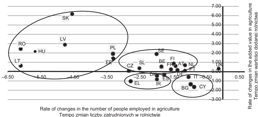
Fig. 3. Average annual rate of changes in the added value and employment in agriculture in the years 2000–2015 (based on fixed prices from 2010)

At the present stage of economic development in European countries capital is the primary form for the manifestation of relationships of agriculture with non-agricultural sectors of the economy. As it results from data given in Table 1, the highest share of the agricultural sector in the owned productive fixed assets is observed in Bulgaria and in Lithuania (over 7%), in Greece, Estonia, Latvia (over 5%) and in Poland (almost 5%). At the