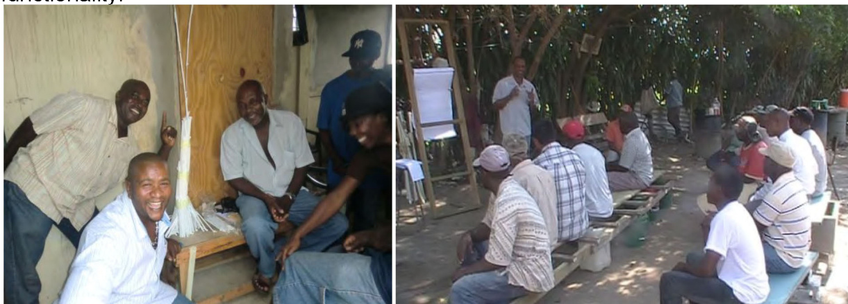
Figure 1: Bernard Lodge United Progressive Farmers Co-op during team building training (left) and marketing training (right).

Training was conducted with the respective groups, facilitated by the expertise of officers from government and private sectors. A memorandum of understanding was signed off on with the extension division of the Ministry of Agriculture and Fisheries in Jamaica, RADA to assist with the technical training of the producer groups. Consultants with specialized expertise were also brought in for the group dynamics sessions from agencies such as the Dispute Resolution Foundation. The training sessions in the form of on-farm discussions and demonstrations were effective, as the producer groups were able to gather at a convenient location in their communities and participate freely. The short questionnaires distributed before and after each session were used as a marker to determine how effective the messages were delivered by the trainers, and how receptive the groups were to the new information. In every case, the sessions showed an overall improvement in scores between the pre and post training questionnaires, suggesting increased awareness of best practices and an understanding of group functionality.