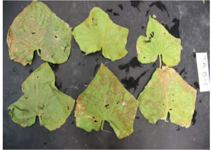
Fig.3. Leaves were randomly picked, photographed, and then sent to NC State Plant Disease Diagnostic laboratory (Todd Wehner) to process with a disease severity assessment key and statistical analysis