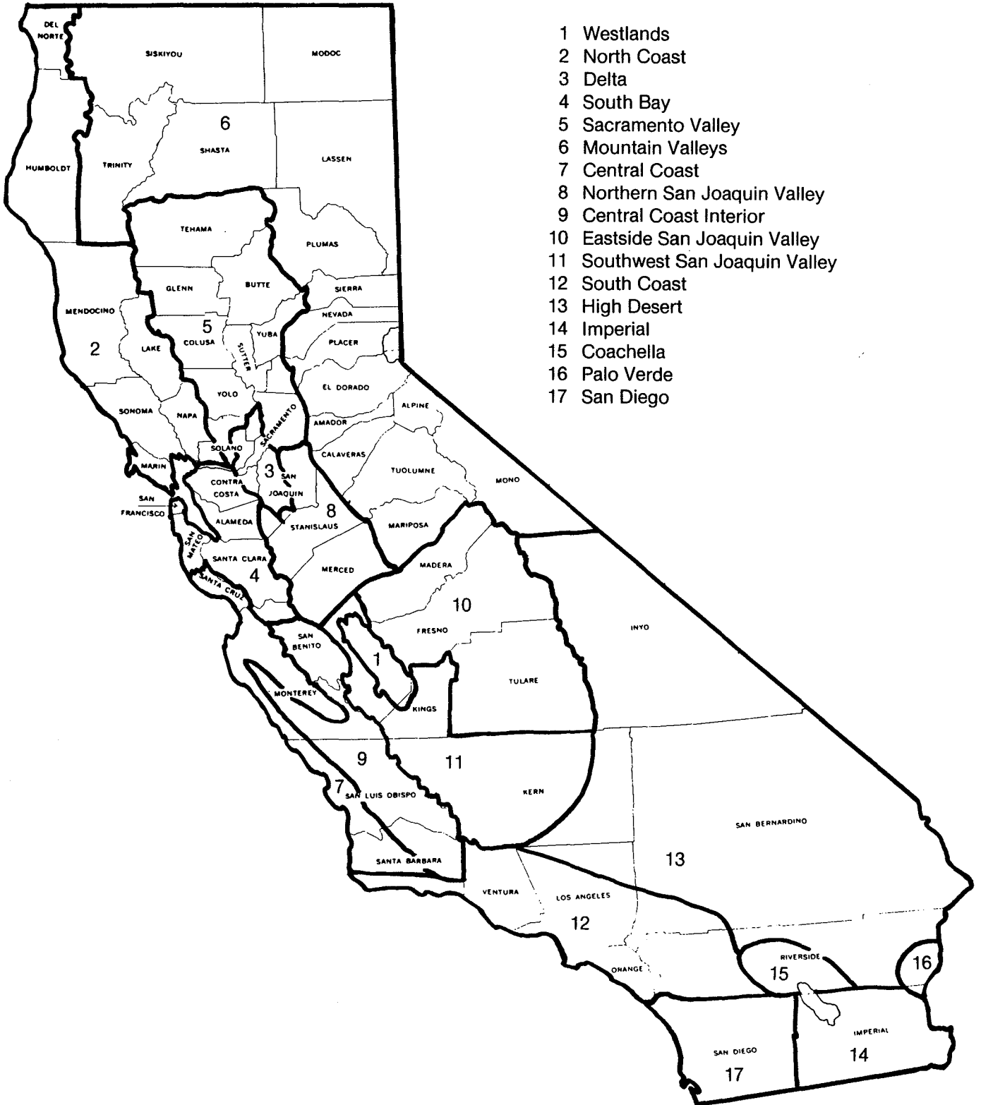
Figure 1. California Agricultural Resources Model (CARM)