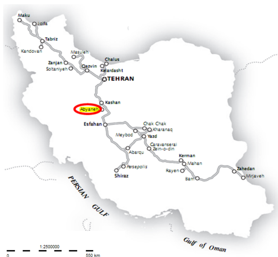
Figure 2: Abyaneh In Iran.

Its attractions are natural scenery and landscape, some historic and cultural monuments, a famous ritual, holy shrine, convince to reach, accommodation facilities (hotel), local products (dried fruits, local sweets) and finally flora and fauna. As it is located near the mountains and desert, the village has a favorable climatic conditions and delicious summer fruits. Abyaneh village is