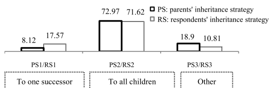
Figure 2. Parent's and respondent's strategy for inheritance of land

also increase the size of transfer farmland. The bar chart F is set on different period in each group due to the time they have planned to transfer farmland.