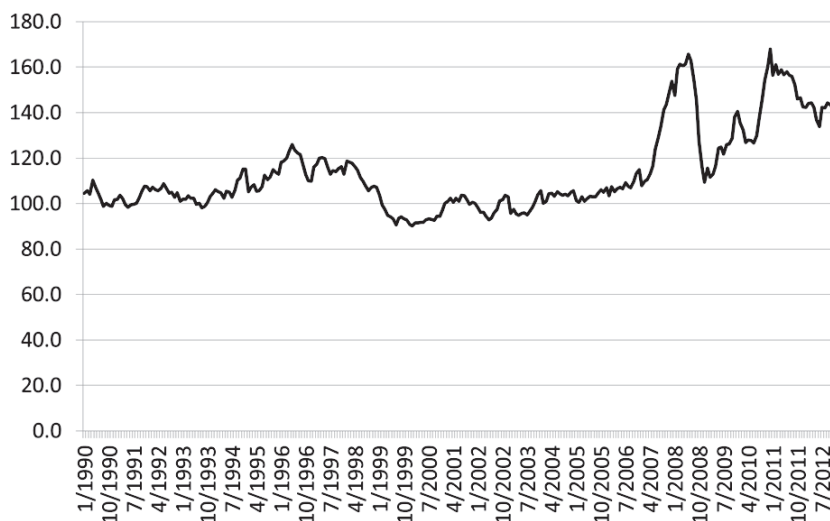
FIGURE 1 FAO Food price index