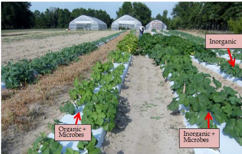
Figure 2c. A picture depicting the physical differences in young okra plants under the different fertilizer treatments.