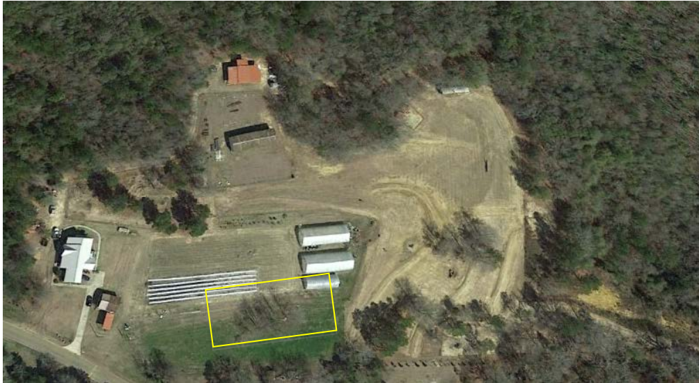
Figure 1. An aerial display of the layout of the 15 acres in active production of fruit, vegetable, and livestock. The study area is outlined in yellow. Not pictured are the 65 acres in forage grasses and forest land.

The experiment was conducted at S & B Farm located in Eufaula, AL (31°46'3"N, 85°11'16.80"W). The farm is 80 acres with 32 acres devoted to animal production (beef cattle, chicken, pigs, and goats) and fruit and vegetable production, and the other 48 acres devoted to agroforestry. For the fruit and vegetable production, the farm utilizes tunnel houses and plastic on drip irrigation. A map display of the study area is shown in Figure 1.