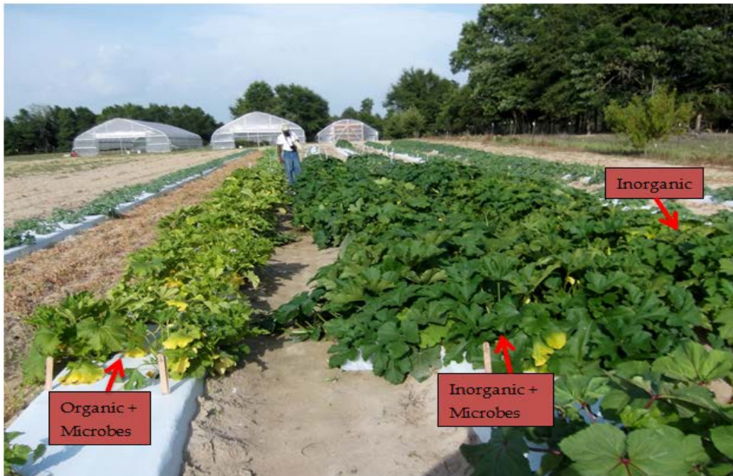
Figure 2a. A picture depicting the physical differences in squash plants at flowering under the different fertilizer treatments.

These factors may have enhanced the synthesis of photosynthates by increasing the synthesis of growth regulators. According to Sarhan et al. (2011), bio- and organic fertilizer had an additive impact on the growth and yield of squash plants. Though no measurements were taken for plant physiology/anatomy during the growth period in this study, there were clear physical differences in the growth of the three plants as demonstrated in Figures 2a, 2b, and 2c.