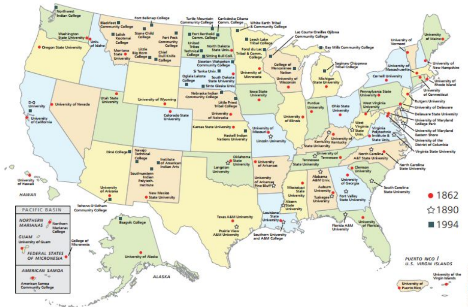
Figure 5. Land Grant Colleges and Universities. Note 1890 Land Grant Universities denoted by stars.

The 2012 Farm Bill includes a Socially Disadvantaged Farmers and Ranchers Policy Research Center, designated for an 1890 Land Grant University. Unfortunately, the original announcement indicated funding at $400,000. This is in stark contrast to other USDA funded centers that have received funding at levels of $10 to 40 million.