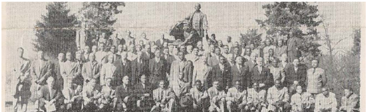
Figure 6. PAWC Participants, 1951

Figures 6, 7, and 8 show participants at 1951, 1989, and 2014 Professional Agricultural Workers Conferences (PAWCs). The predominance of participants in 1951 and 1989 was adults well into their careers. In the last few years, the number of young people participating has steadily increased. In this year's audiences, we have a mixture of young and older participants. This is a good sign that we are preparing the leadership for tomorrow who will continue Carver's goals to use science and agriculture to help his people and in so doing help the world.