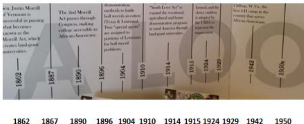
Figure 4. Timeline for the Cooperative Extension System Developed for the 100 th Anniversary Celebration