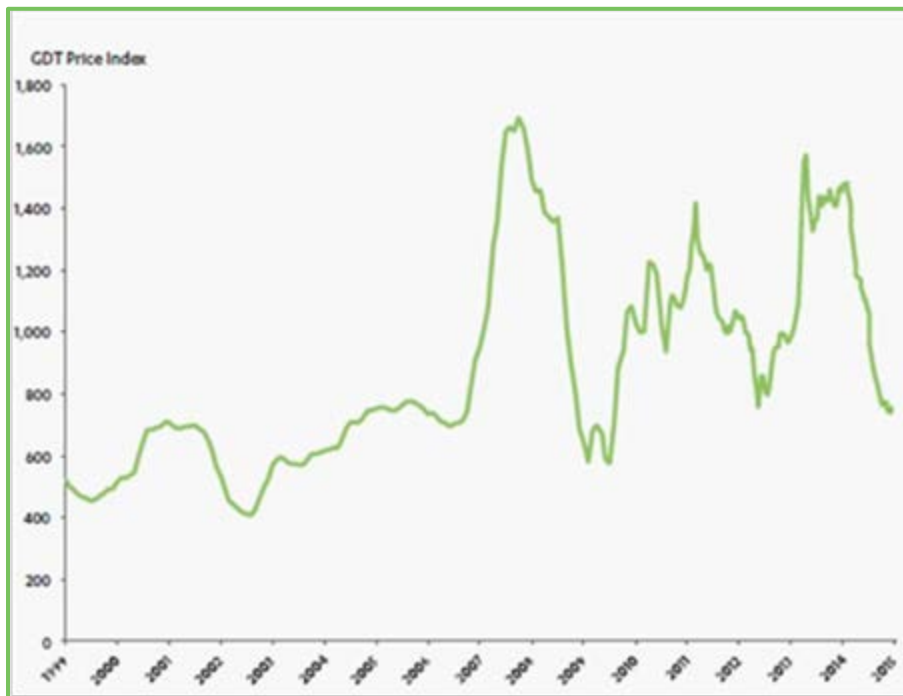
Figure 1. Global Dairy Trade Index from 1999 to 2015.

Farmers worldwide face an increasingly turbulent business environment (Boehlje, Gray, and Detre 2005; Gray, Dooley, and Shadbolt 2008, Parsonson-Ensor and Saunders 2011). The increase in volatility of milk price, illustrated in Figure 1, is an example of such turbulence for New Zealand dairy farmers with milk prices received halving/doubling from year to year since 2006. However, as identified by various farm management scholars, farm management research has focused on efficiency and optimizing system performance during short-term periods of stability rather than focusing on the development of long-term adaptive capacity under periods of turbulence (Chapman et al. 2007; Boehlje et al. 2005; Darnhofer, Fairweather, and Moller 2010; Darnhofer, Gibbon, and Dedieu 2012) The consequence is a reductionist approach to farm management aimed at achieving solutions which are not necessarily the best or most resilient systems under more volatile business environments. Shadbolt, Rutsito, and Gray (2011) recognize that a core competency of a resilient farming system is its ability to adapt to shifts in the environment, to capture the opportunities that might arise from disturbance and hence outperform those who do not adapt. Resilient farms are therefore reliant on the resilient qualities of human beings - flexibility, motivation, perseverance and optimism—because one cannot separate the business from the people forming and operating them.