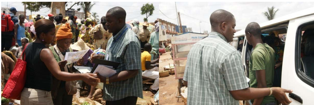
Figure 4. Recruitment of the participants

recruitment was done randomly in order to avoid self-selection and self-recruitment. To convince the participants, a flyer showing pictures of the realization of experimental auctions in other African countries was presented to them (Figure 3). The recruiters explained to participants that they were going to participate in a 2.5-hour market test and receive a participation fee of 3,000 FCFA “for their taxi back home.” The latter pretext is commonly used in Africa to detach pecuniary endowments from their “gift” or “payment-for-service” context. It elegantly avoids the fee being seen as a quid pro quo for which participants should reciprocate (Lusk and Shogren, 2007), and which may bias the bids (Loureiro et al. , 2003). Every time a woman was convinced, the recruiter gave her a voucher for participation to the experimental auction and invited her to take place in the car. Fifteen women aged in the range of 19–65 years were recruited each session.