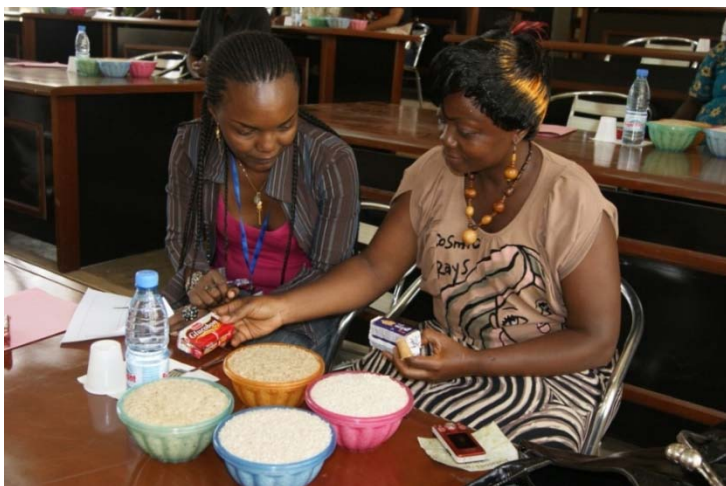
Figure 5. Training session with biscuits