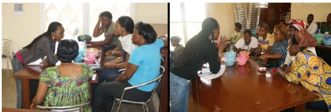
Figure 7. Collective Induction Treatment (CIT)