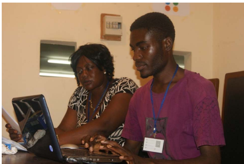
Figure 9. Data entry during the experimental auctions

An input template was created in Microsoft Excel 2007 on the basis of different bids and questions of both types of questionnaire. Data entry was done simultaneously with the auctions (Figure 8).