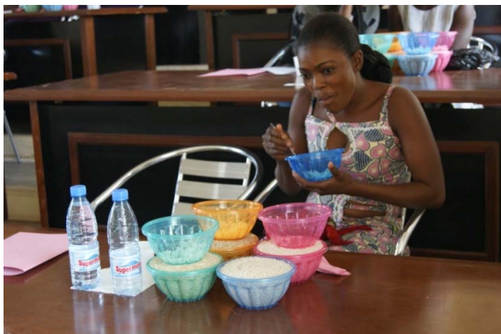
Figure 6. Sensory test