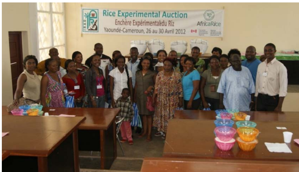
Figure 8. Group picture of the IRAD staff and women recruited for one of the experimental auction sessions