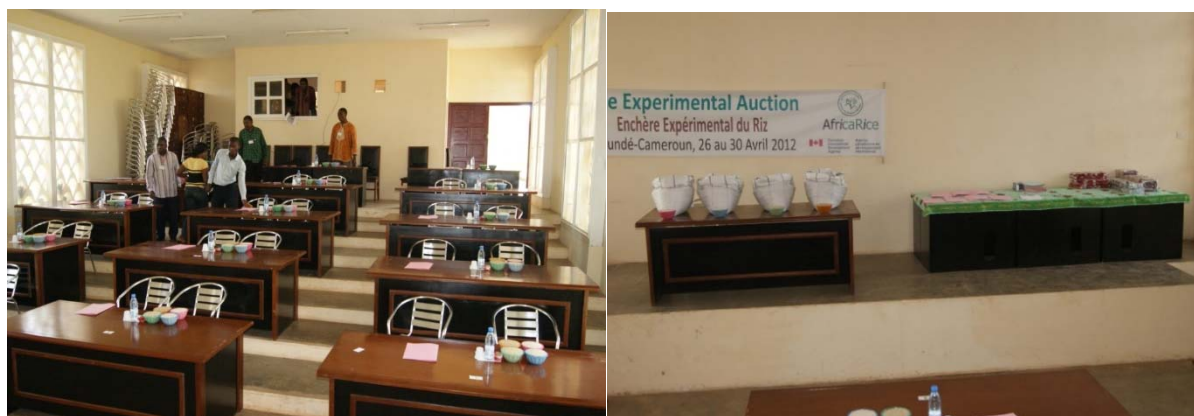
Figure 2. Preparation of the laboratory

From the 24 th to the 25 th of April 2011, a training on experimental auctions was held for 16 researchers and other staff members from IRAD. The first part of that training (24 th April 2011) was theoretical and the second part was practical (25 th April 2011). On the second day, the room was prepared and the team was divided into an animator, a co-animator, recruiters, auctioneers, enumerators, a cooking team and trained respectively in the domains concerned. The room was the amphitheater of IRAD Nkolbisson, which is five kilometers from Mokolo market. Inside a banner was extended on the front wall. The front stage featured a table displaying four bags containing different rice types. The 15 tables reserved for the participants were divided into three rows of five tables (Figure 1).