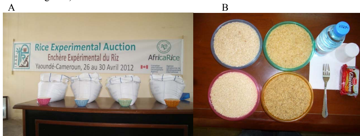
Figure 3. (A) Linear projection on the presentation table in front of the room and (B) quadrangular presentation of the alternative rice types on the individual tables (pink dish = Non-parboiled broken (NPB) Tox 3145 rice = benchmark; blue dish = Non-parboiled homogenous (NPH) Tox 3145 rice; green dish = Tox 3145 rice parboiled through the improved technology (GEM); orange dish = “Traditionally parboiled” (TRAD) Tox 3145 rice)

In order to simulate a market setting, we presented the four rice types in four plain white half-filled 50 kg bags on a table in the front part of the closed amphitheater room (Figure 2A), such as they are typically presented on the market. The rice types were also presented on the participants' tables in four dishes, each one containing one kilogram of uncooked rice of each type. However, in order to avoid lining-up bias (Demont et al. , 2012), we avoided presenting the rice types in a linear fashion on the individual tables but instead presented them in a quadrangular way (Figure 2B). During the experiment, participants could examine the visual (purity and homogeneity) and sensory (taste and aroma) quality attributes of the uncooked rice types (taste is typically tested by biting on the uncooked grains).