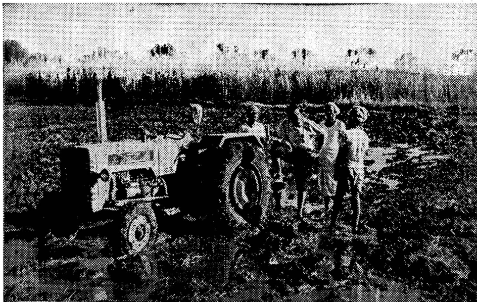
Friend, helper, technical expert to the Indian farmer: the Voltas man