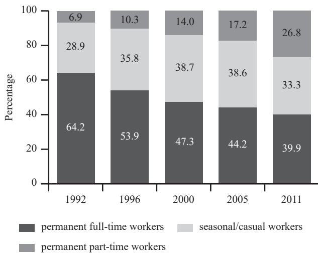
Figure 1: On-farm employment of the population from family farms in Poland, 1992-2011, per cent.

Furthermore, our research shows that the drop in the population engaged only in agricultural activity also led to changes in terms of the amount of work performed (Figure 1). These the share of permanent, full-time farm workers fell from 64.2 in 1992 to 39.9 per cent in 2011 and this was