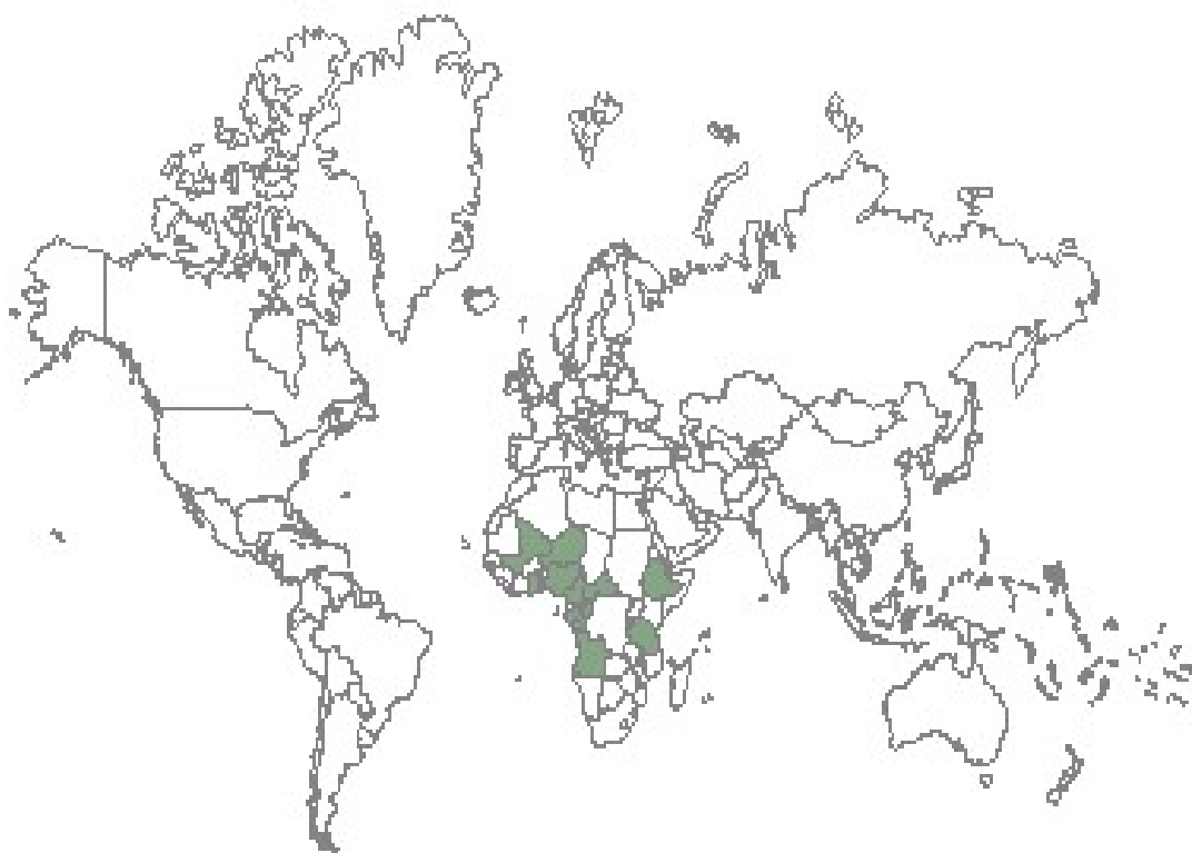
Figure 1. The centre of diversity for African yam bean

AYB tolerates wide geographical, climatic and edaphic ecologies. The stretch of the environment where it thrives lie within the latitudes of 15^\circ North to 15^\circ south and the longitudes of 15^\circ West to 40^\circ East of Africa (Adewale et al., 2008). There is no record of the origin of the crop in any other continent except Africa (Potter & Doyle, 1992; Potter & Doyle, 1994). Hence, the above geographical catchments could be referred to as the centre of diversity of AYB (Figure 1). This confirms the common claim that the crop is a tropical African legume.