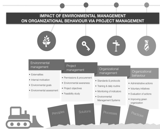
Figure 1 - Impact of Environmental Management on Organizational Management via Project Management