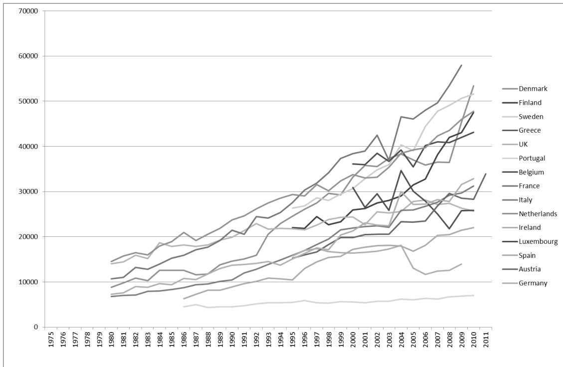
Figure 1. Development of the agricultural valued added per worker in the EU-15 countries (USD constant) (World Bank 2015).