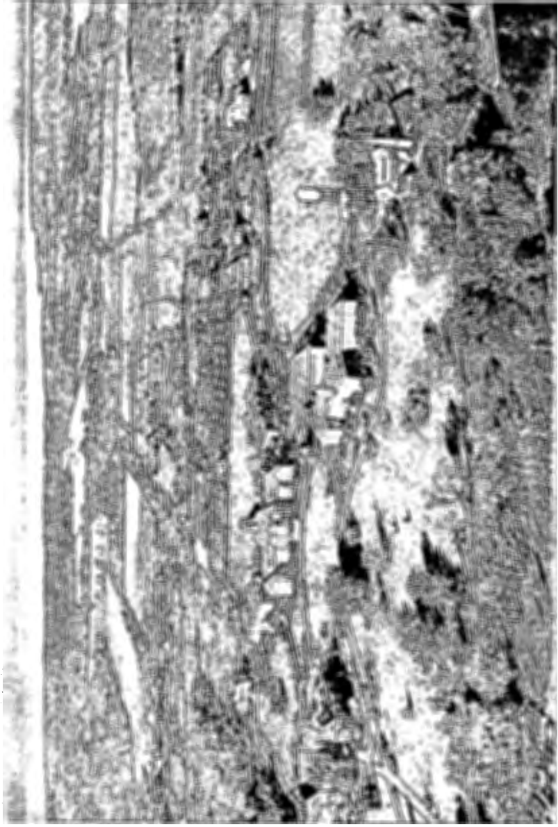
MACDONALD COLLEGE, QUEBEC