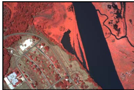
Figure 6 Santee Public School is located in lower left corner of this image. Planning evacuation routes around major infrastructure is an important use of remote sensing imagery.

The hyperspectral data collected over the reservation could be utilized for many purposes. A railroad track runs near the town center where most of the major buildings are located. Hyperspectral imagery could identify weed problems along the tracks. These weeds could potentially be a fire hazard if sparks from the train were to ignite them.