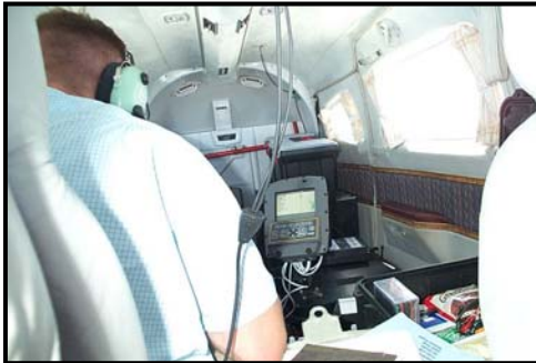
Figure 3 Airborne remote sensing mission in progress over the Winnebago Reservation.

This facility also fosters close interaction between the university and industry as well as government agencies nationwide. The Nebraska Airborne Remote Sensing Facility is currently the only full-time operating platform in the United States. Since