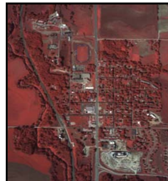
Figure 4 Winnebago Reservation Color-infrared imagery

The NASA Nebraska Space Grant & EPSCoR Program has placed an emphasis on working with Native American communities in the state. In 2002, a Geospatial Extension and Research Specialist (GES) was hired to help disseminate geospatial technologies to tribal communities. The GES acts as a liaison between tribal communities and the Nebraska Airborne Remote Sensing Facility. The Winnebago and Santee Sioux are extremely interested in using remote sensing and other geospatial technologies to manage tribal resources including transportation routes and infrastructure.