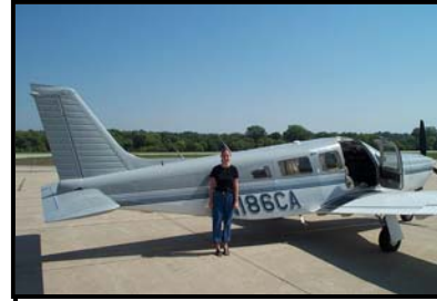
Figure 2 Piper Saratoga

The University of Nebraska at Lincoln's (UNL) Remote Sensing Program and the University of Nebraska at Omaha's Aviation Institute (UNOAI) have cooperatively developed the Nebraska Remote Sensing Facility. The result of this partnership is the development of one of the most innovative airborne remote sensing facilities in the United States.