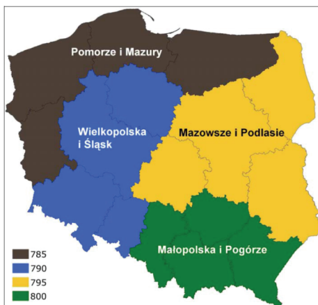
Figure 1. FADN regions