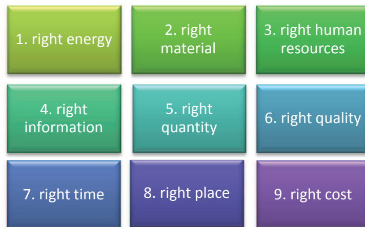
Figure 1: The 9Rs criteria of logistics

From a logistical point of view each process component must provide “appropriate” cost dependent output and results. Appropriate according to the following criteria, and includes the appropriate transmission of the first four factors in the supply chain: (Szegedi – Prezenszki, 2010)