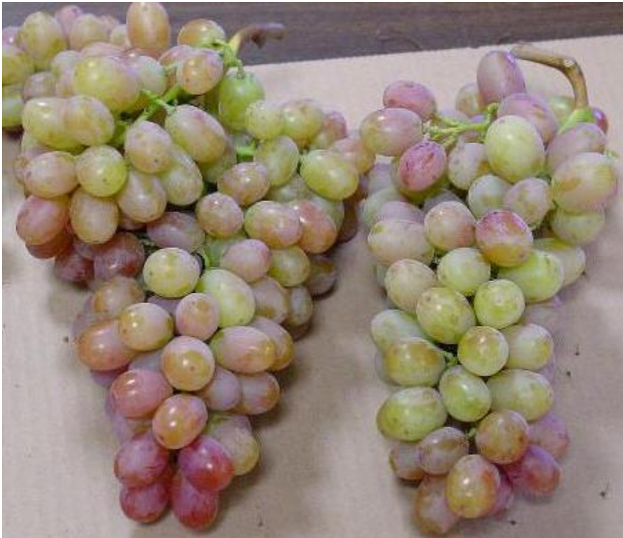
Borderline U.S. No. 1