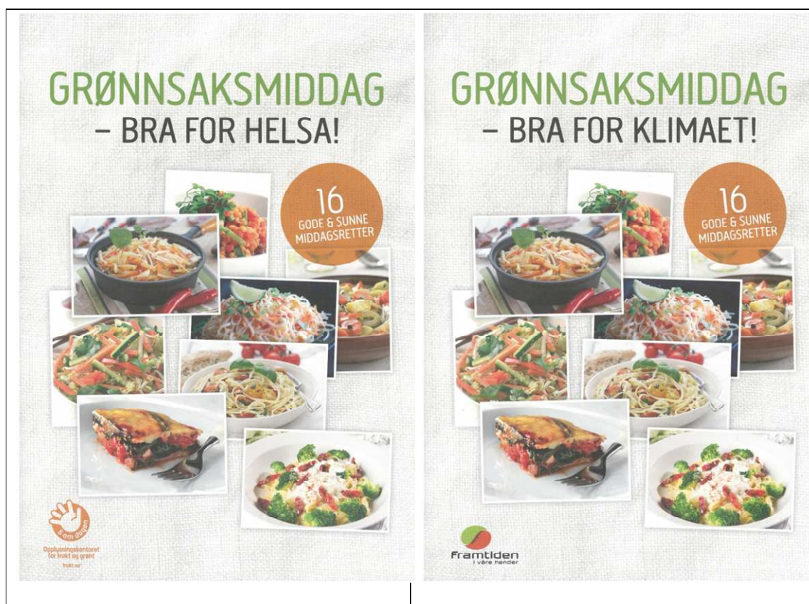
Fig. 1. Front pages of recipe booklet with vegetable main dishes.

The front pages of the booklets are shown in Fig. 1 below. The booklet to the left shows the version promoting vegetables as healthy while the booklet to the right shows the version promoting vegetables as climate friendly.