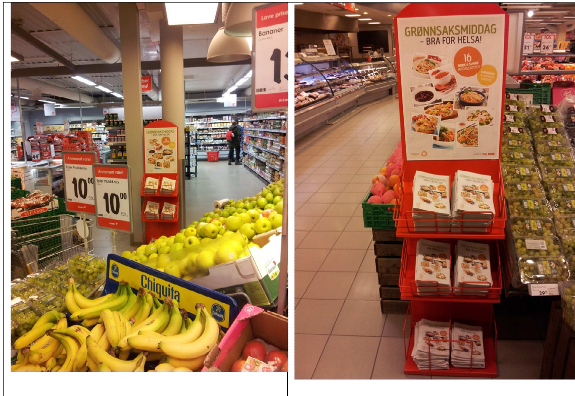
Fig. 2. Placement of booklets in stores.