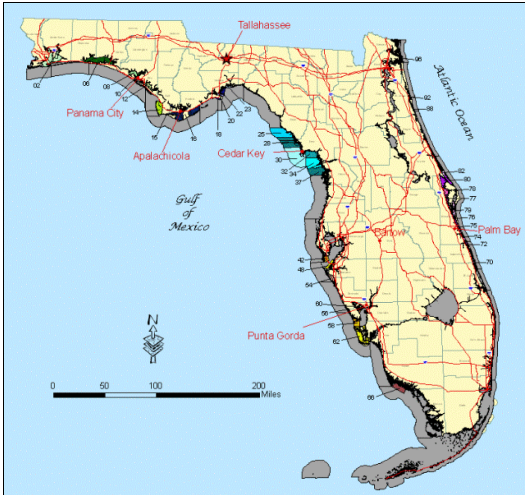
Figure 3. Florida Shellfish Harvesting Area Map (FDACS, 2015).