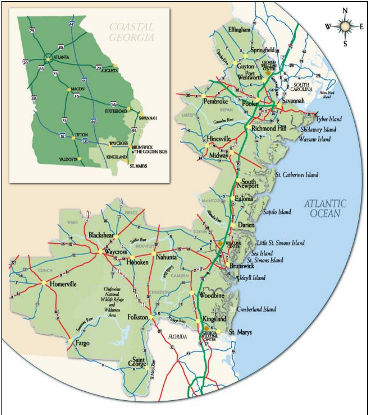
Figure 4. Georgia Shellfish Harvesting Area Map (GCTA, 2015).