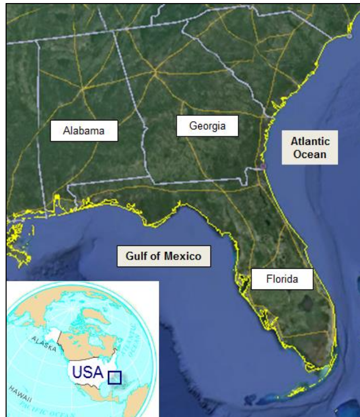
Figure 1. Map of United States showing the states of Alabama, Florida and Georgia and their proximity to the Gulf of Mexico and Atlantic Ocean.