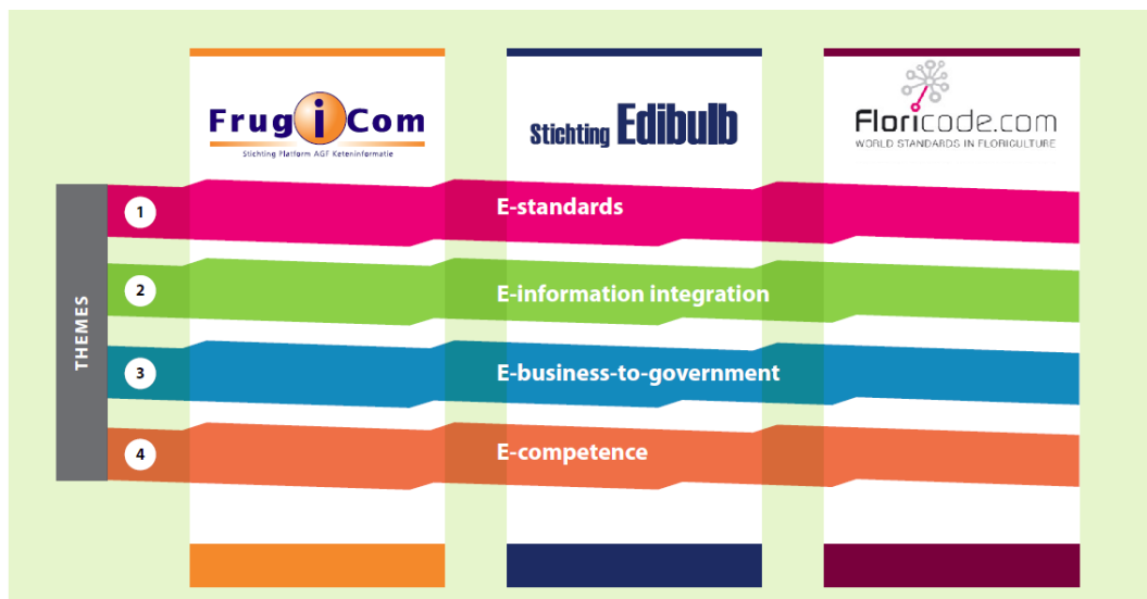
Figure 2. Focus areas of the Digital Greenport Holland

The activities of Digital Greenport Holland focus on four main themes (see Figure 2): information standards (E-standards), information integration within and between businesses in chains and networks (E-information-integration), information exchange between companies and governments (E-business-to-government) and increasing awareness, knowledge and skills on digital information management (E-competence).