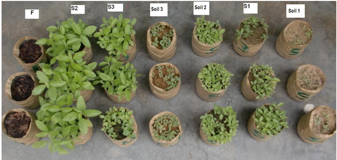
Figure 4: Young Seedlings of Lippia multiflora After 60 Days of Sowing