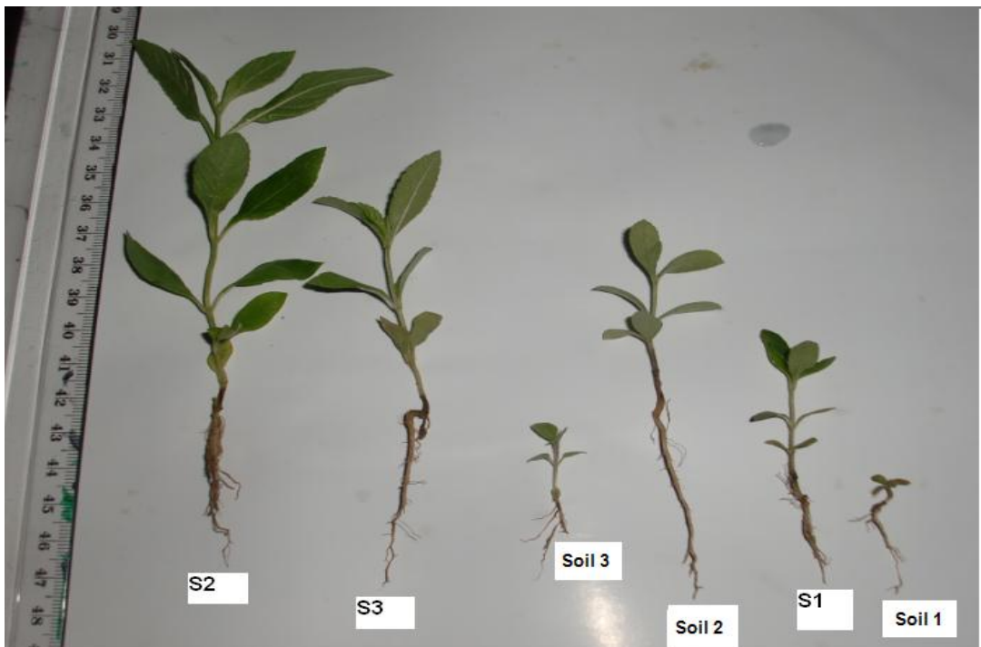
Figure 5: Root System of Lippia multiflora Seedlings 60 Days after Sowing