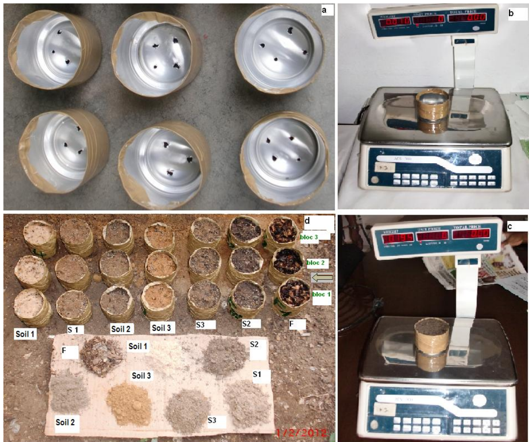
Figure 2: Experimental Device

experiment. Total of 7 substrates repeated 3 times (21 tins) were obtained and arranged in blocks of Fischer in a space provided. The seeds were sown at a rate of 25 per container in an upright position, because of their small size. Seeds were then gently covered with a thin layer of each substrate ( Figure 2d ).