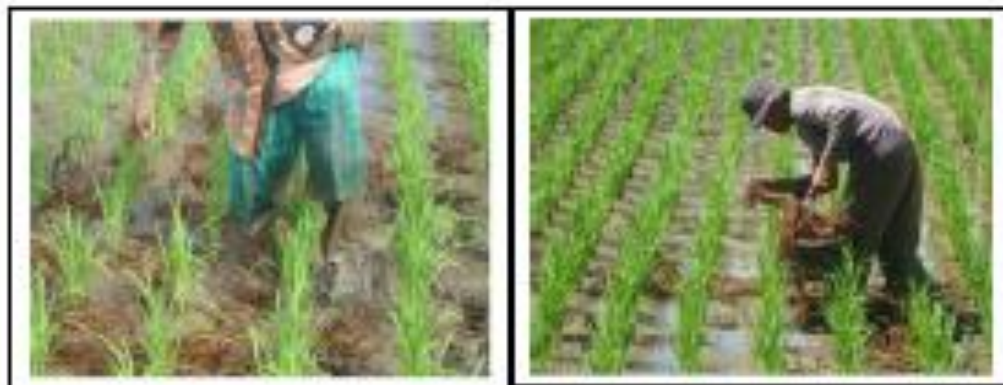
Figure 2.5: Application of straw compost within plant row after the first weeding (about 2 – 3 weeks after transplanting). The straw is placed or incorporated into soils by stepping (Simarmata and Joy 2011)

activity, the weeds that still exist and growth closely to the rice clumps can be eliminated manually. Subsequently, it is recommended applying of inorganic fertilizers to boost the plant growth.