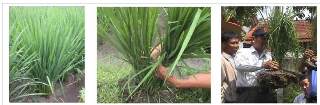
Figure 2.2: The tiller number about 60 – 80 per clumps and growth performance of SOBARI rice (variety of Ciherang), while the flooding rice produced only 20 -30 tillers (Doc. Simarmata, 2006 – 2007).

Under submerged conditions the roots grow is limited and rice plants spend lot of its energy and some of the roots' cortex disintegrates to form air pockets ( Aerenchyma tissue pockets (aerenchyma) so that oxygen can reach root tissues. In addition, under flooded conditions up to 3/4 of roots may die by the time of flowering (panicle initiation) (Uphoff 2004; Simarmata 2008). Field results revealed that wider space combined with good water and nutrient management increased the tiller number and growth significantly (Figure 2.2).