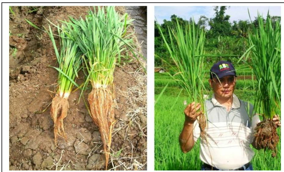
Figure 2.1: Roots system and tiller number of SOBARI rice under muddy condition (aerobic) is about 3 – 5 greater than permanent flooding rice (anaerobic) (Simarmata, 2007)

The population of beneficial microbe (nonsymbiotic nitrogen fixers such as Azotobacter sp & Azospillum sp and phosphate solubilizing bacteria) and roots growth were increased highly significantly compared with anaerobic conditions (Simarmata 2008). The rice roots system under aerobic to muddy condition was about 5 – 10 times greater than flooding ecosystem. It has been revealed only about 30% of rice roots growing well. Consequently, the potential obtained yield of various rice varieties is the work of only 30% rice roots. If roots system growing optimally in step with the rice production, the potential yield of various rice variety may increase by at least 2 three times. Therefore to change permanent flooding rice ecosystem to aerobic conditions (field capacity to muddy) is absolutely necessary to increase the rice production and to save water irrigation significantly.