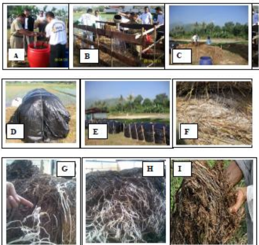
Figure 2.2: In situ direct composting of straw (A = preparation of decomposer inoculant, B = compost box, piling of straw and inoculation, C= Straw pile, D= covering straw pile G & H = mycelium of fungi is growing well on straw compost and I = mature straw compost (Simarmata & Joy, 2011).

increasing population of organisms in straw compost (bacteria, fungi, animal and others) will improve the quality of straw compost significantly (Figure 2.4). In general, the straw compost content about 30 – 40 % of total carbon (rich in humus and organic acids), 1 – 1,5 %, 0,5 % P_2O_5 , N, 2 – 3 % K_2O , 3 – 5% of SiO_2 and other essential nutrients. In situ composting of straw has been developed (Simarmata and Joy 2010) for the remediation of paddy soils in Indonesia (Figure 2.4).