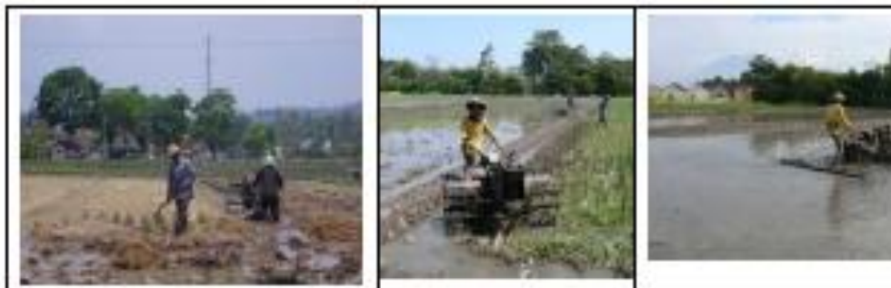
Figure 2.4: Spreading and incorporation of straw compost and following with land cultivation or preparation (Simarmata and Joy, 2011)

decreased to below < 20 and the rice seedling or rice seed can be planted.