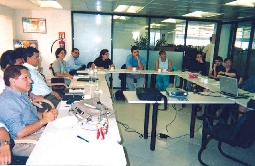
A cooperation program entitled “Policy and Trade Node: Focal Point Mexico” has been developed.

Mexico possesses significant capabilities and experience in one of the most complex areas of public policy reform: institutional reform and the development of instruments for the agricultural sector, within the framework of trade liberalization processes.