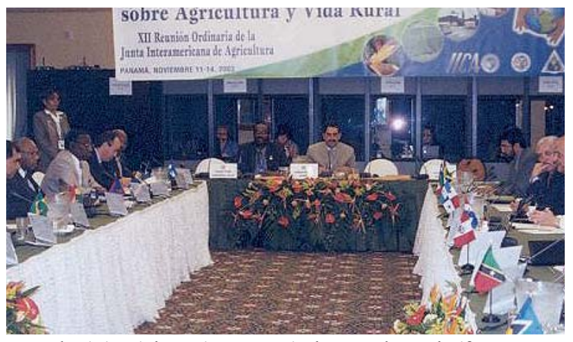
Second Ministerial Meeting on Agriculture and Rural Life 2003.

Coordinator, Office of Follow-up of the Summit of the Americas Process, IICA