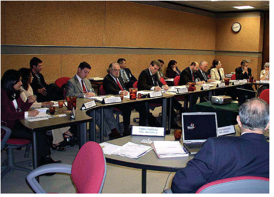
A strategic framework for agriculture and rural life.

<u>Greater public interest and understanding:</u> agriculture and rural life, strategic issues for development