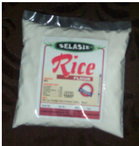
Fig. 2. Branded Rice Flour.