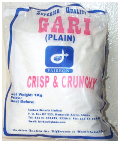
Fig. 6. Branded Plantain Gari.