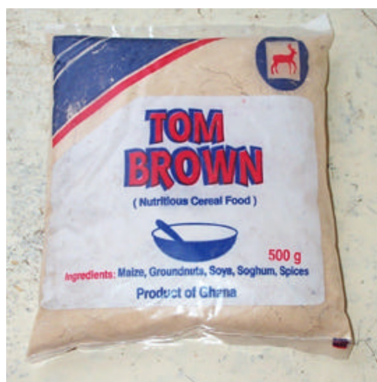
Fig. 3. Branded Composite Flour Product – Tom Brown.