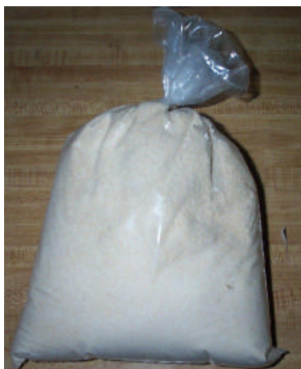
Fig. 7. Packed Unlabeled Flour (Fufu).

Consumer preferences for selected product attributes measured in terms of responses to “agree/disagree” to declarative statements about selected product attributes (table 5) include cooking quality,