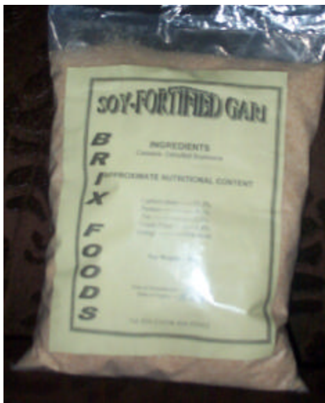
Fig. 4. Branded Soy Fortified Gari.