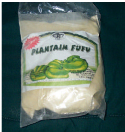
Fig. 5. Branded Plantain Fufu.