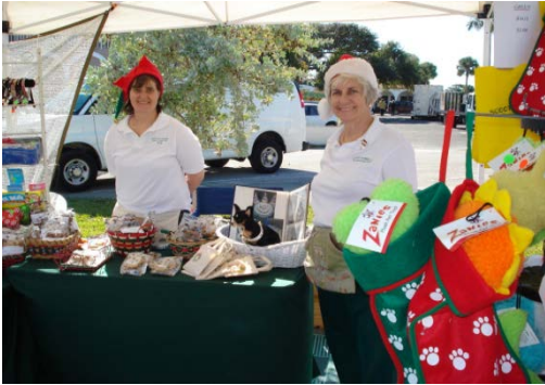
Photo: Farmers Market Oceanside, FL http://tcollier4480.webs.com/apps/photos/photo?photoid=20713368