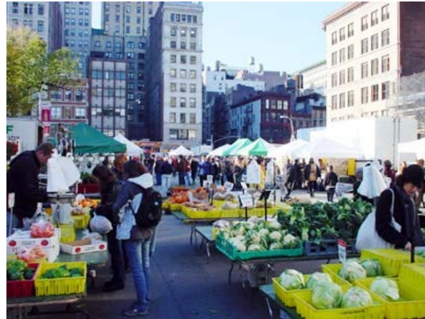
Photo: Union Square NY City Farmers Market http://www.urban75.org/photos/newyork/ny169.html

Source: USDA-AMS Marketing Services Division