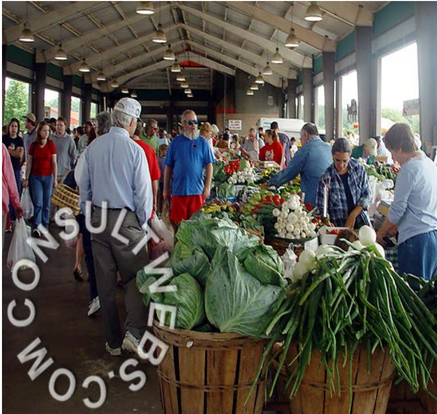
Photo: Raleigh NC State Farmers Market http://www.consultwebs.com/farmers_market/

Revenues at Farmers Markets are tough to gauge because many vendors operate on a cash basis but data from the latest National Farmer Market Managers survey from 2005 indicated total sales were slightly over $1 billion, up from $888 million in 2000