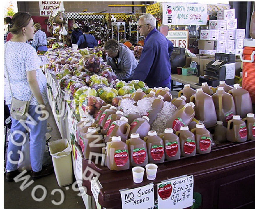
Photo: Raleigh NC State Farmers Market http://www.consultwebs.com/farmers_market/