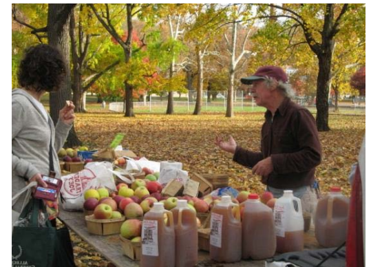
Photo: Northside Farmers Market, Pittsburg, PA http://connect.sierraclub.org/post/Groups/Fans_of_the_Farmers_Market/photos/img3474.html