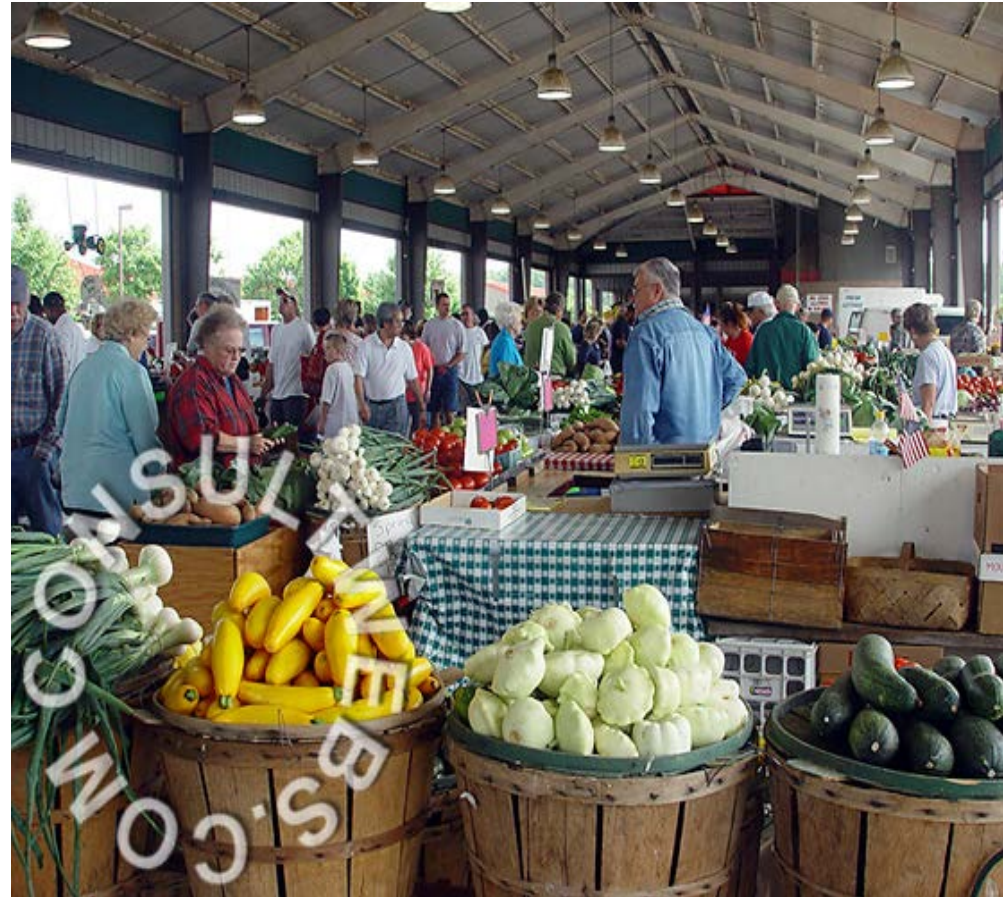
Photo: Raleigh NC State Farmers Market http://www.consultwebs.com/farmers_market/