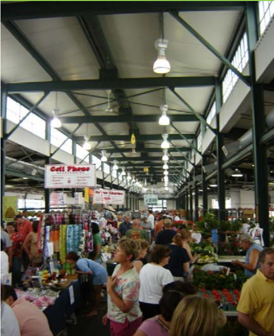
Photo: Syracuse , NY Regional Market http://activerain.com/blogsviw/114413/syracuse-at-its-best-regional-market-farmer-s-market