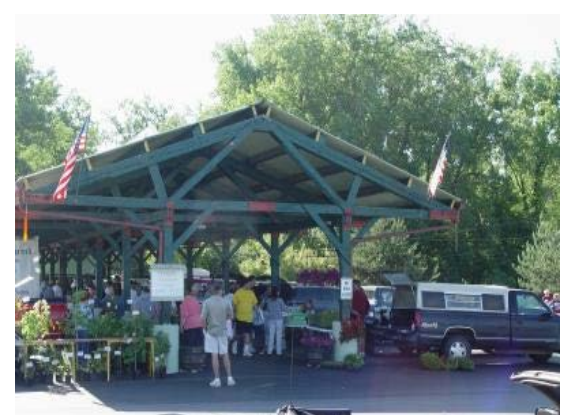
Photo: Parkville, MO Farmers Market http://www.parkvillemo.net/parkvillemo/1066.pms