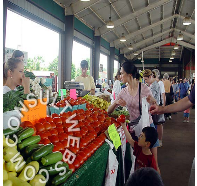
Photo: Raleigh NC State Farmers Market http://www.consultwebs.com/farmers_market/