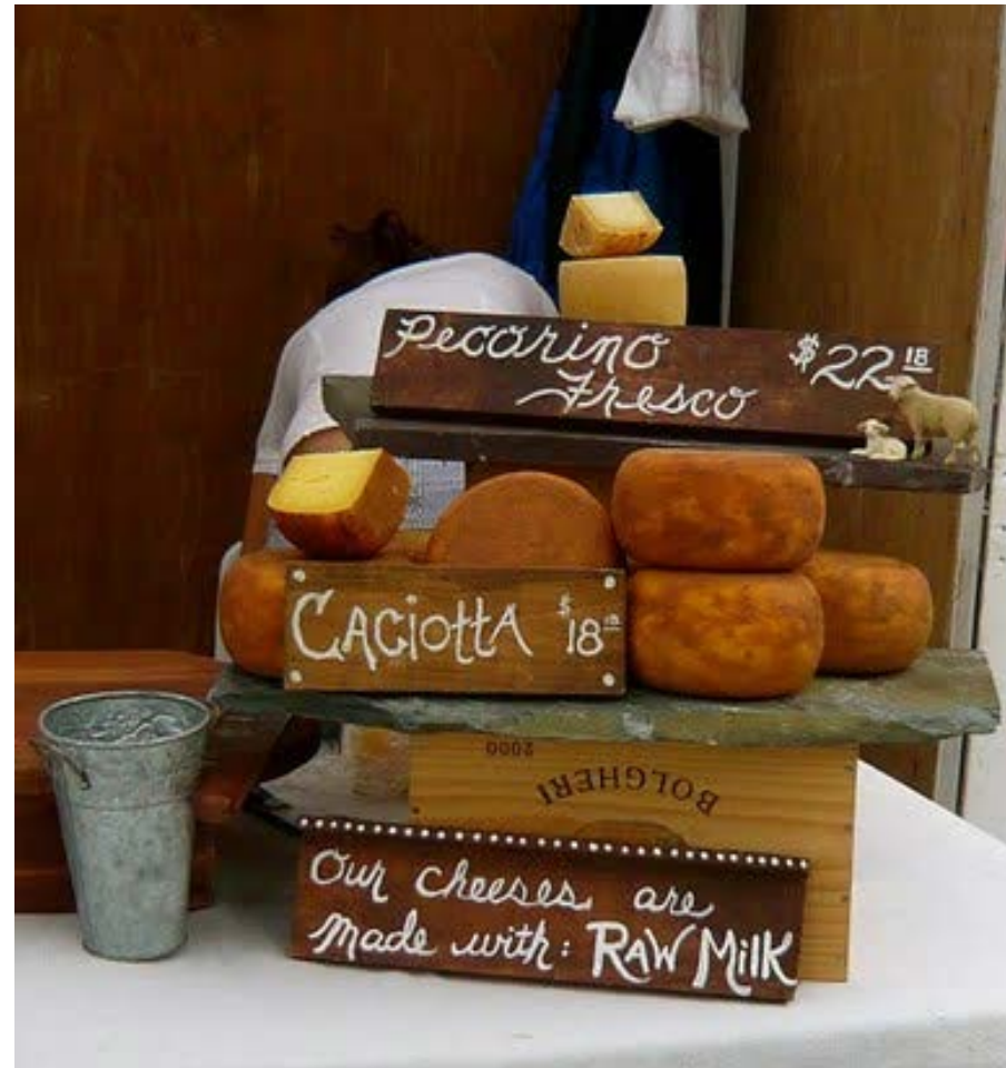
Photo: Union Square NY City Farmers Market http://veggiegirivegan.blogspot.com/2009/08/new-york-city-revisited-part-3-union.html