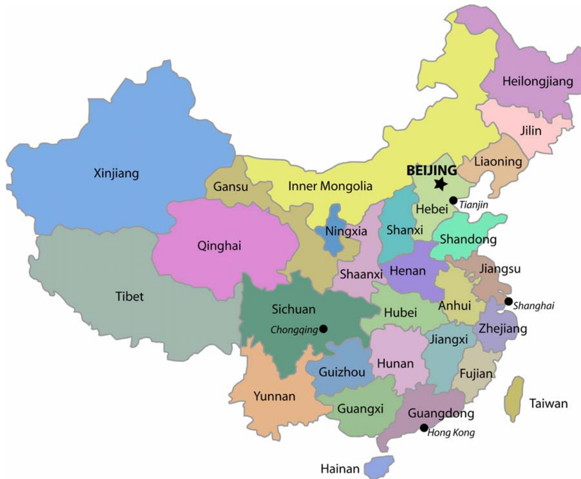
FIGURE 3. Map of China

method instead of the complicated bias-corrected percentile acceleration interval introduced by Efron (1987).