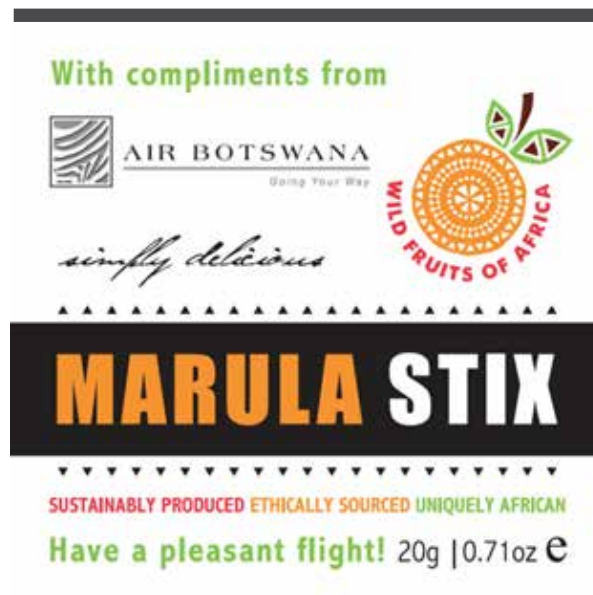
New label of Wild Fruits' snack product served on Air Botswana.

Research for this case study was supported by the Student Multidisciplinary Applied Research Team (SMART) program at Cornell University. The views expressed here are those of the authors and not necessarily those of the organizations for which they work.