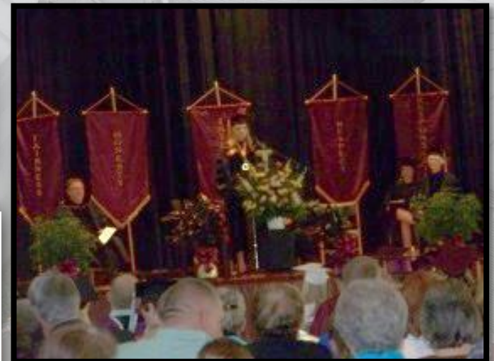
Graduation with Associates 2009