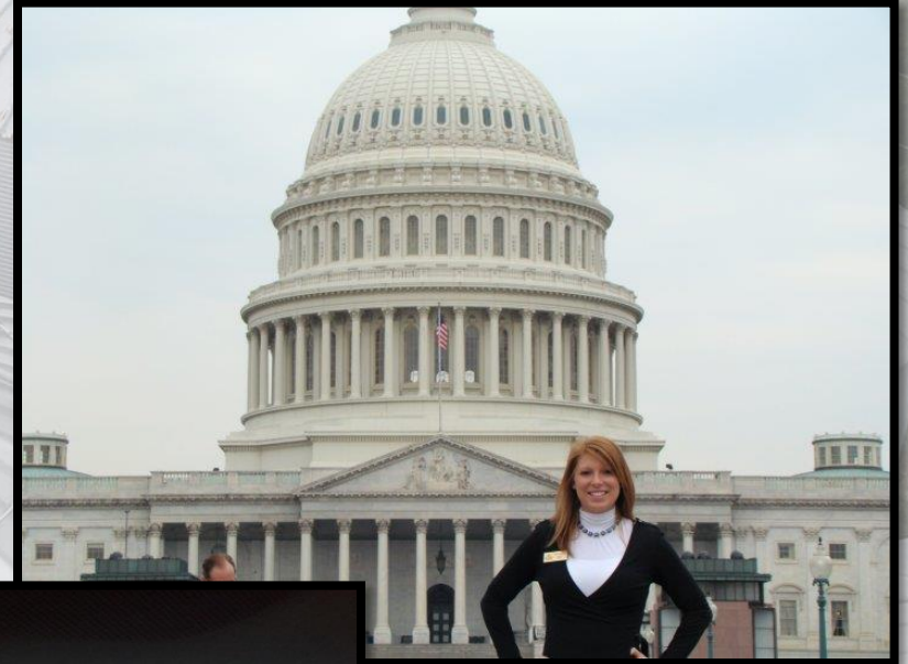
Lobbying For Education