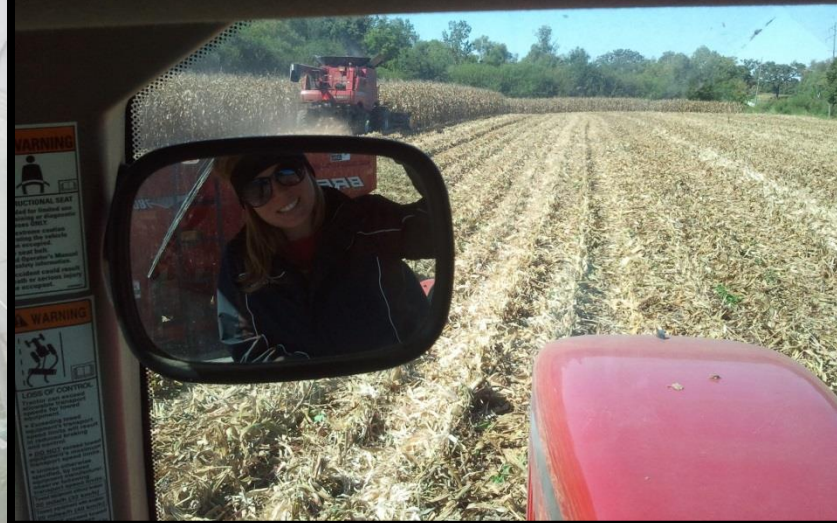
Farming With Dad