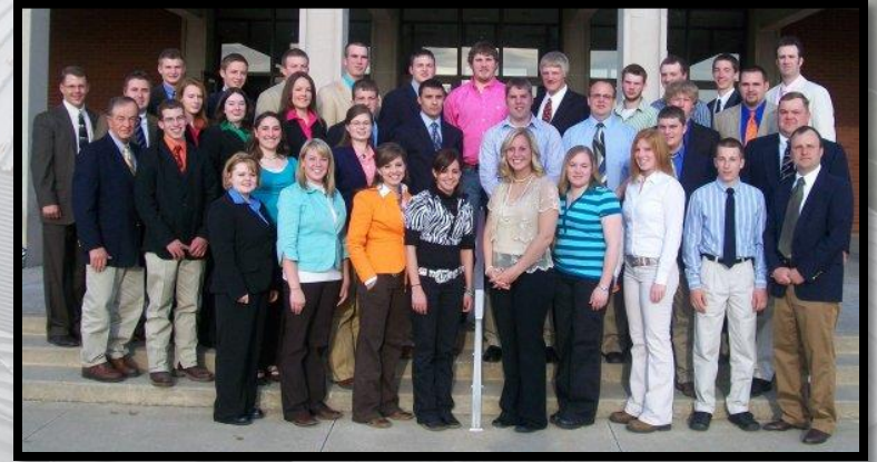
College Agriculture Judging Competition