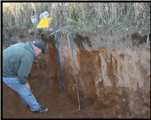
Soil Judging Training