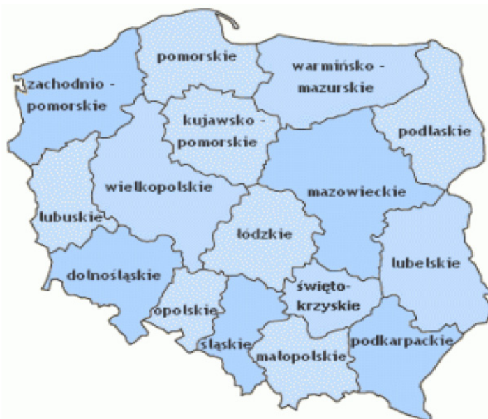
Picture 1. Map of voivodships in Poland

Source: Central Statistical Office, http://www.stat.gov.pl